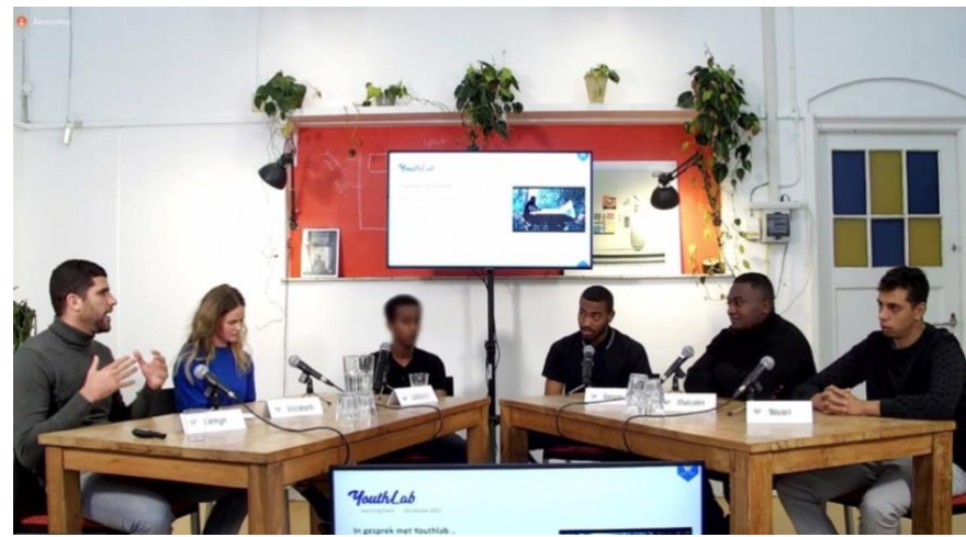
Photo: the online learning event organised by the Youthlab (Young in Prison)

Another activity of the programme was the online learning event that YiP organised in October. Professionals and NGOs in the field of closed (forensic) youth care were given an insight into the different assignments offered by Youthlab. At the same time, they were offered new ideas on how to create space for meaningful youth-led participation in their own work practice. The outcomes of the European Youthlab project, including the documentary 'Exchanging Perspectives', will be presented at the project's Final Conference in Brussels next year.